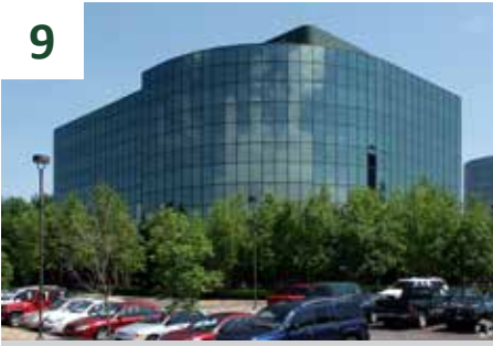
9200 Indian Creek Parkway