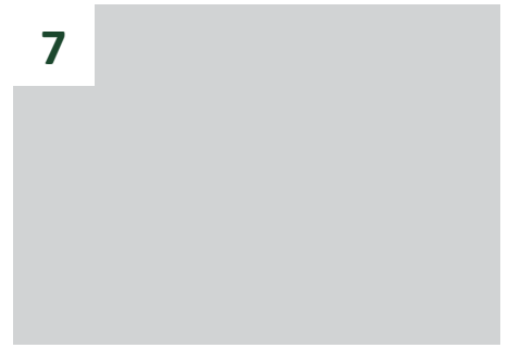
9110 Indian Creek Parkway (Maintenance)