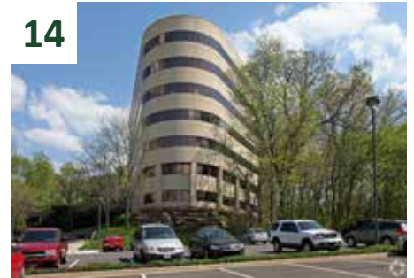
8717 West 110th Street