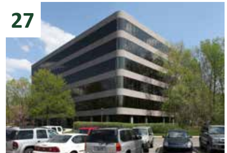
10975 Grandview Drive