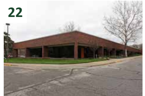
10875 Grandview Drive