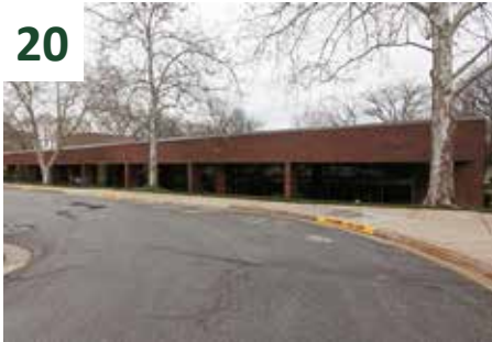
10865 Grandview Drive