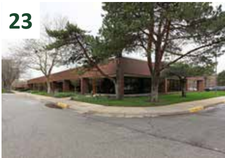
10880 Benson Drive