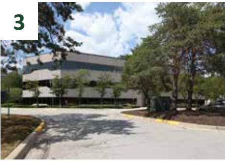
8700 Indian Creek Parkway