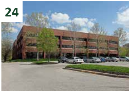
10895 Grandview Drive