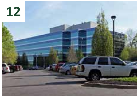
10975 Benson Drive