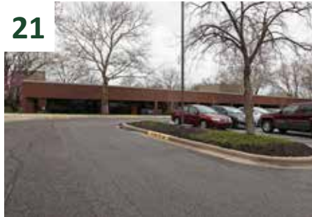
10870 Benson Drive