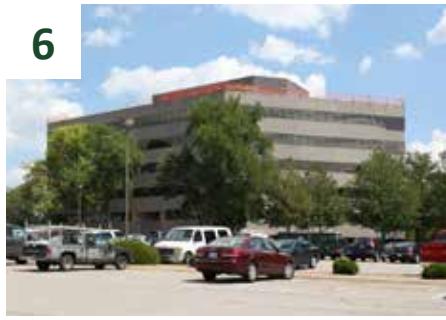
8900 Indian Creek Parkway